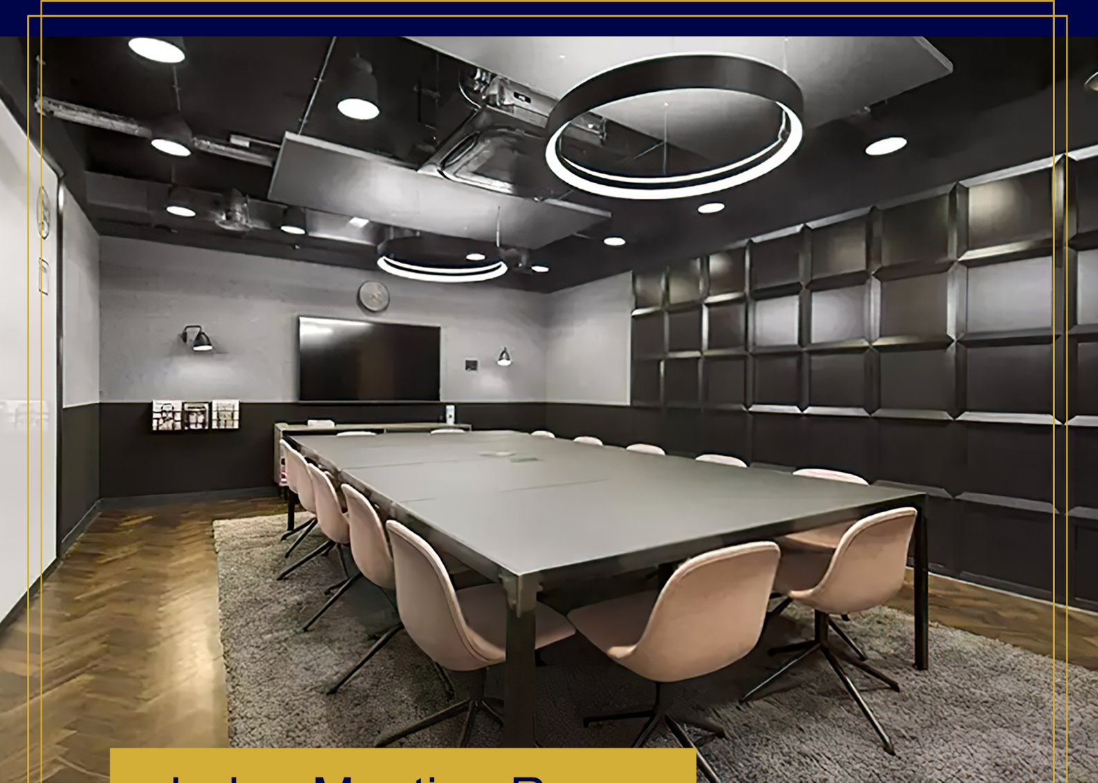
Judge Meeting Room

Barristers' chambers with a laser focus on Construction & Engineering Law